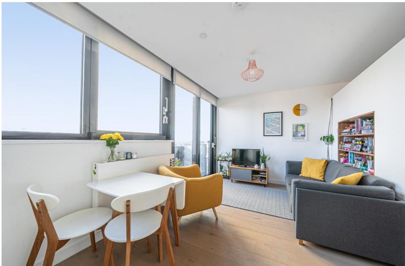
Hill House, N19 5NA