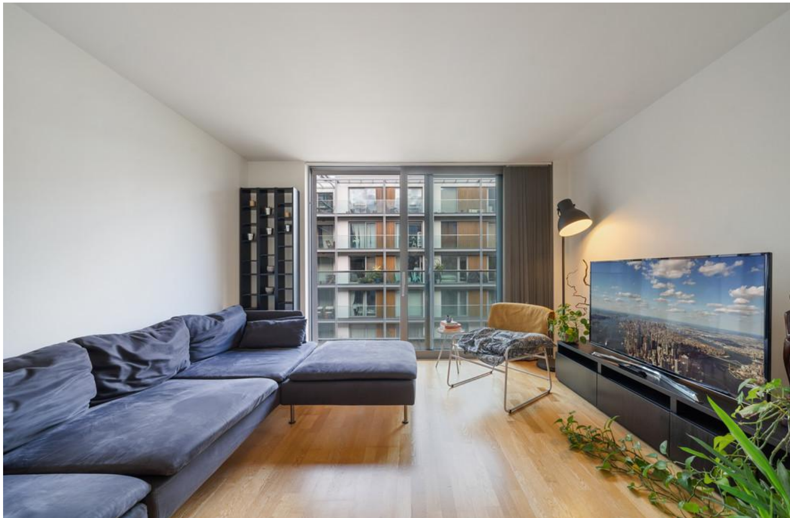
South Stand Apartments N5 1FD