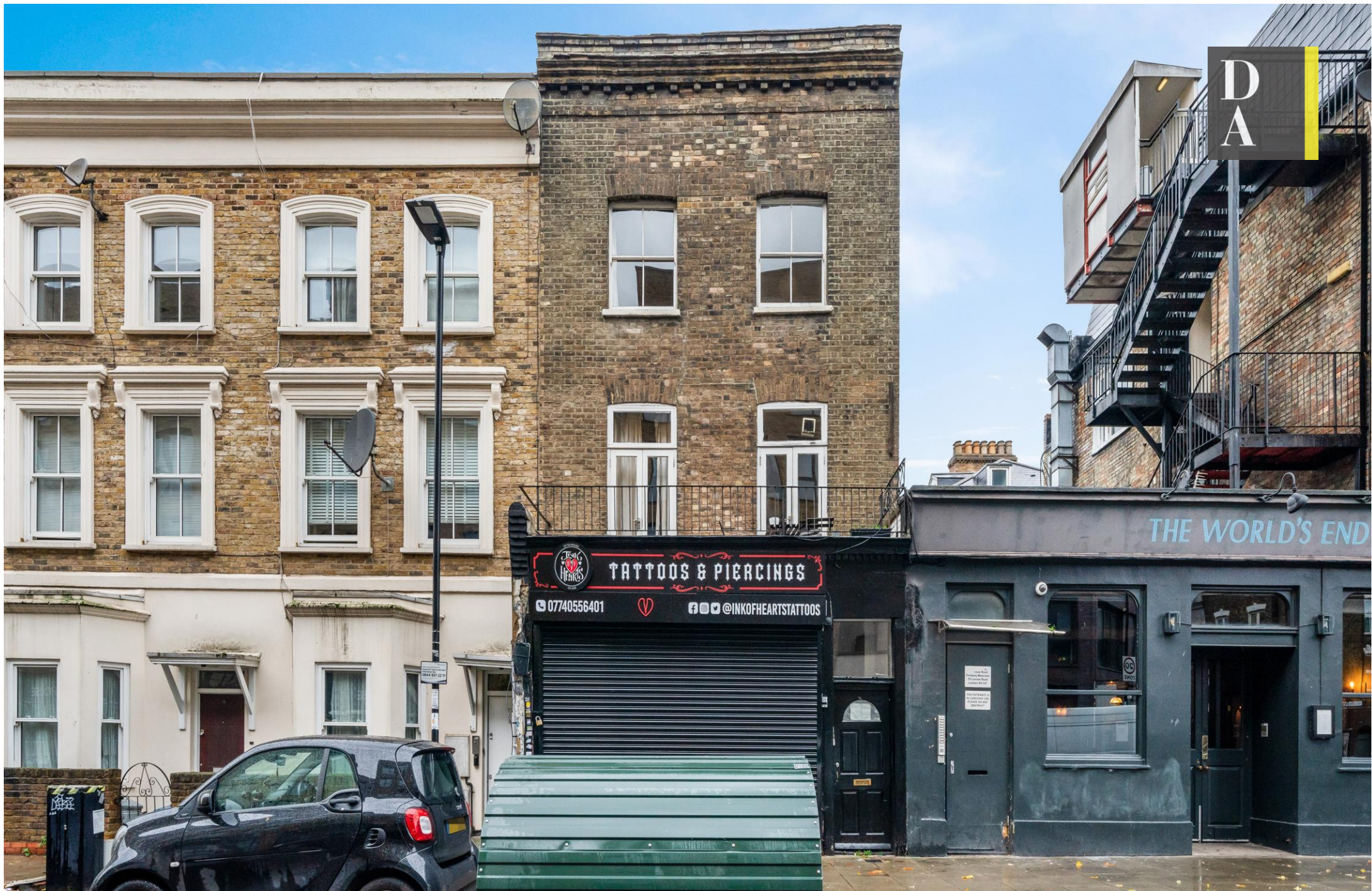
Lennox Road, N4 3JF