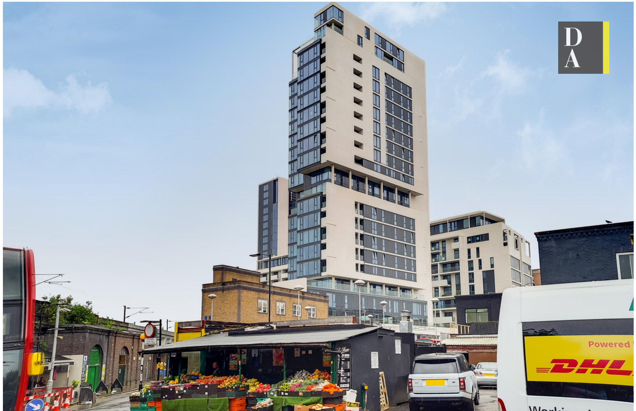
City North Place, N4 3FQ