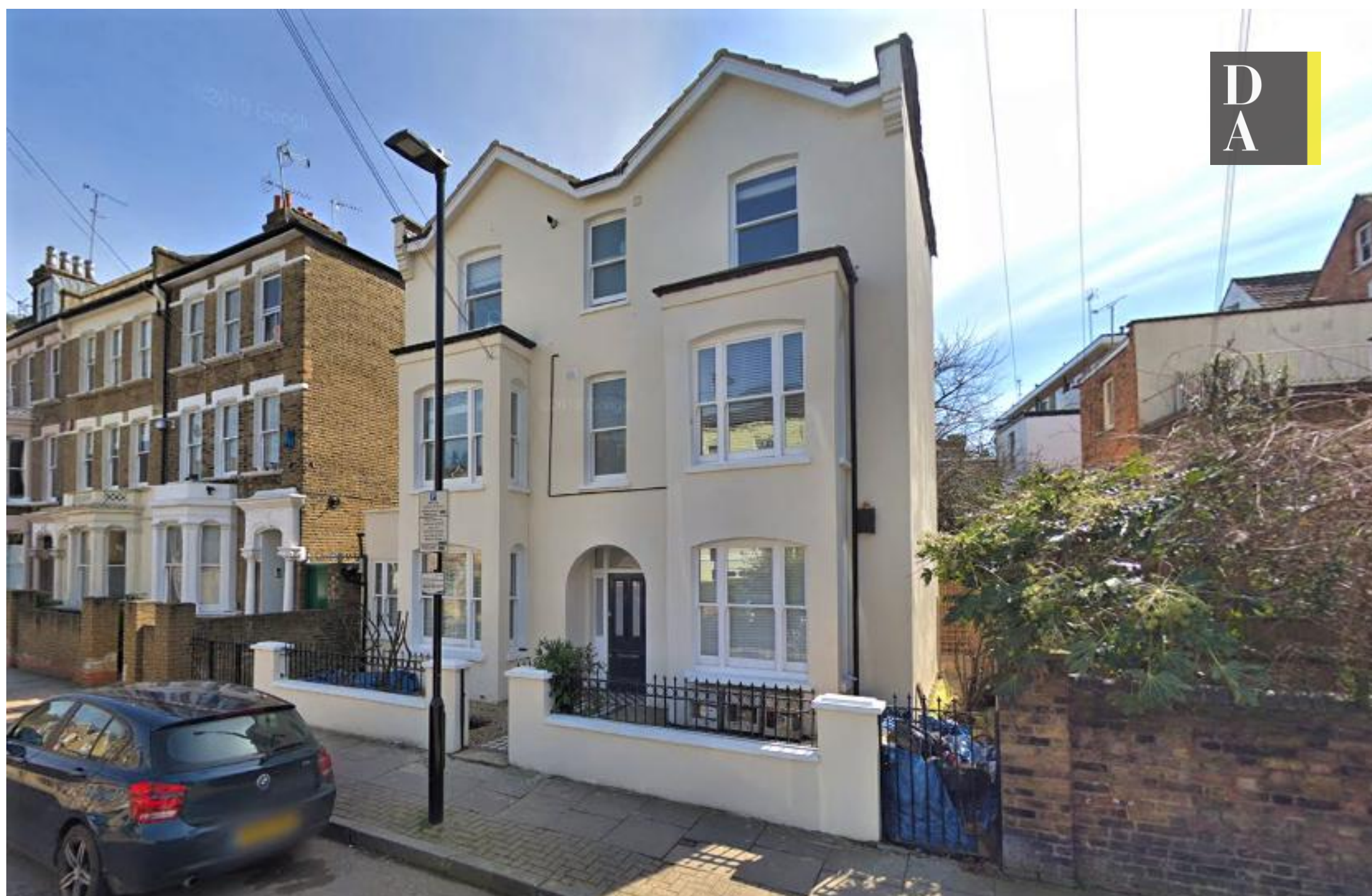
Conewood Street, N5 1BZ