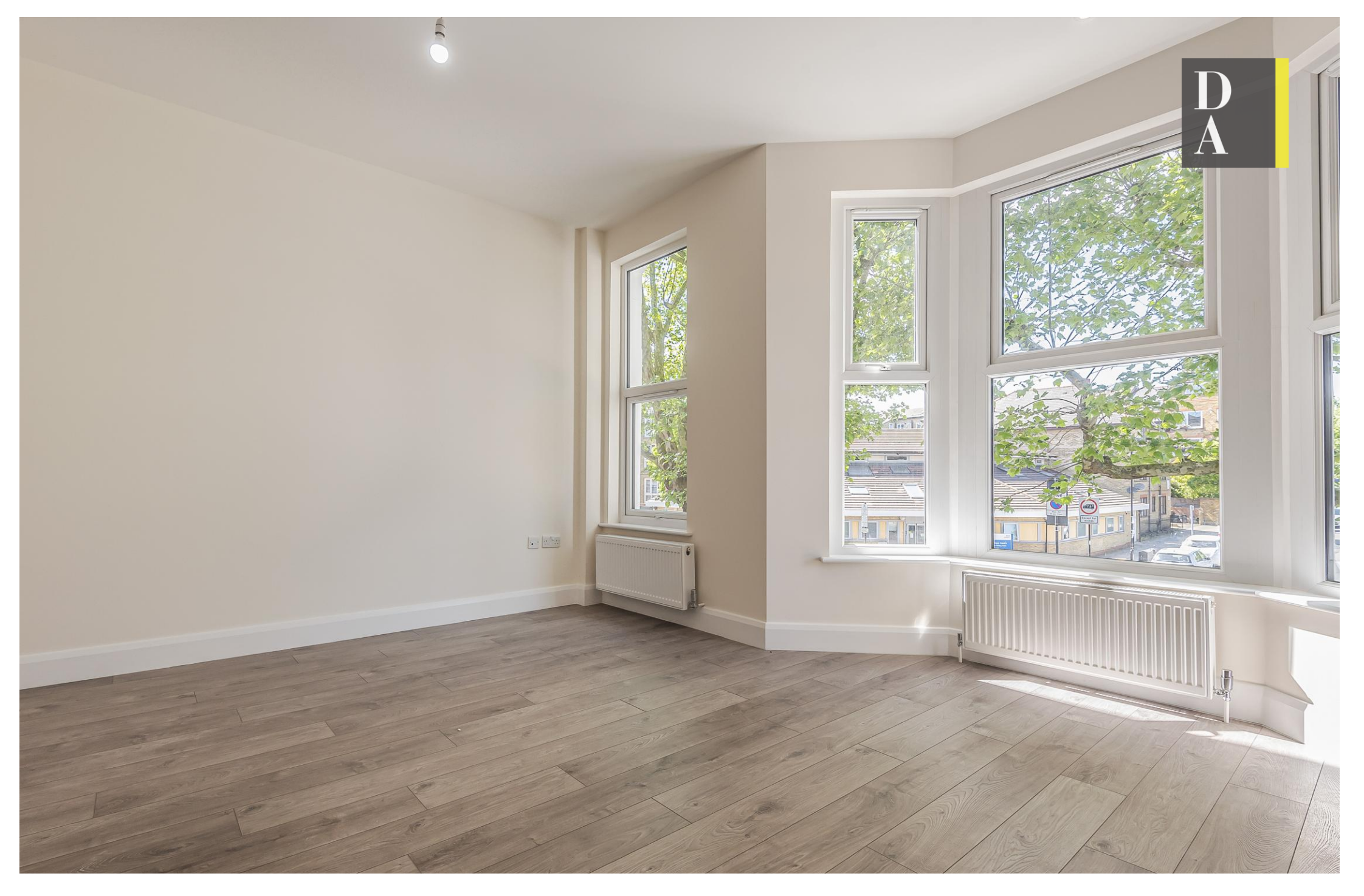
Hanley Road, N4 3DR