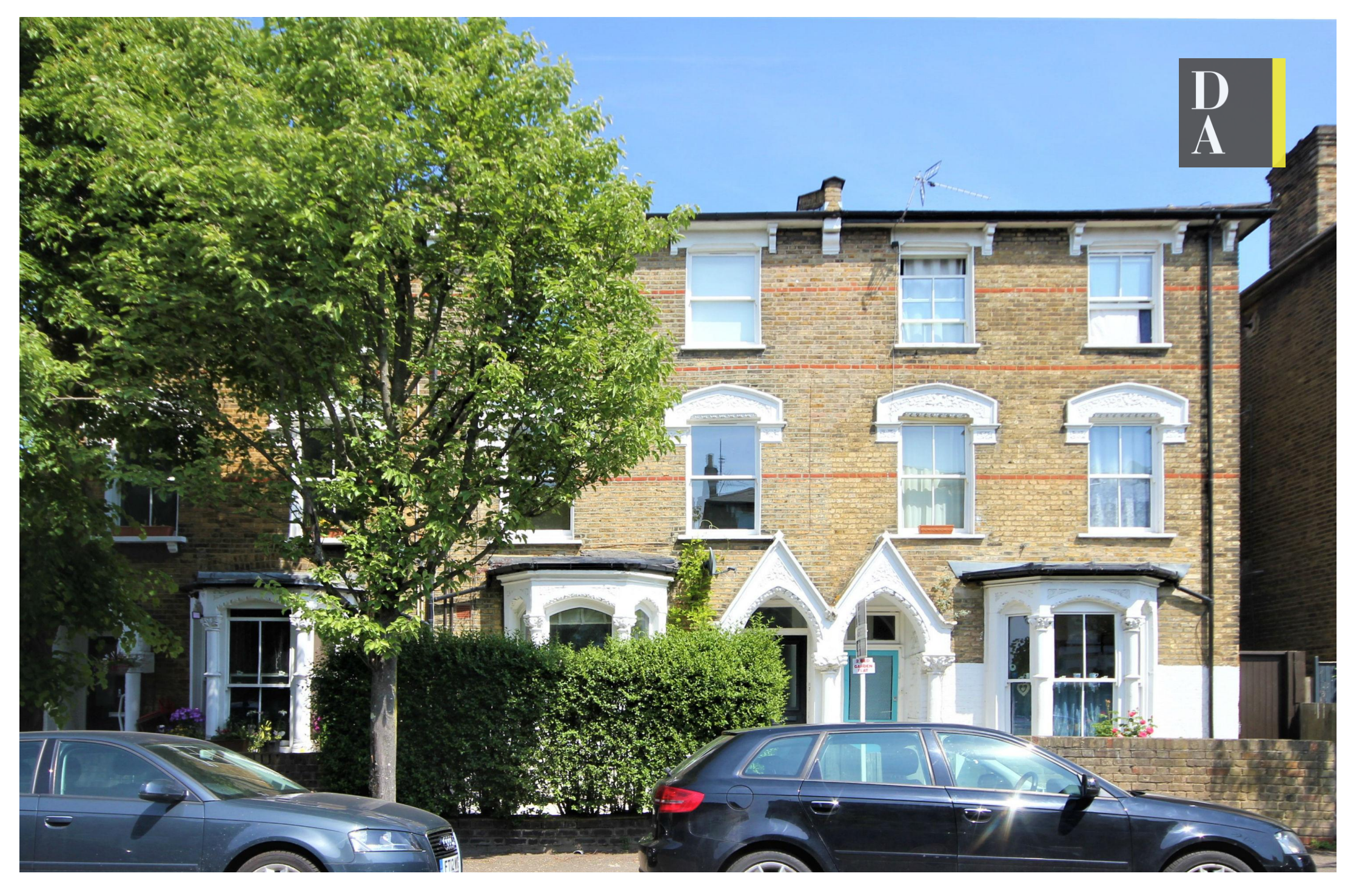
Lancaster Road, N4 4PP