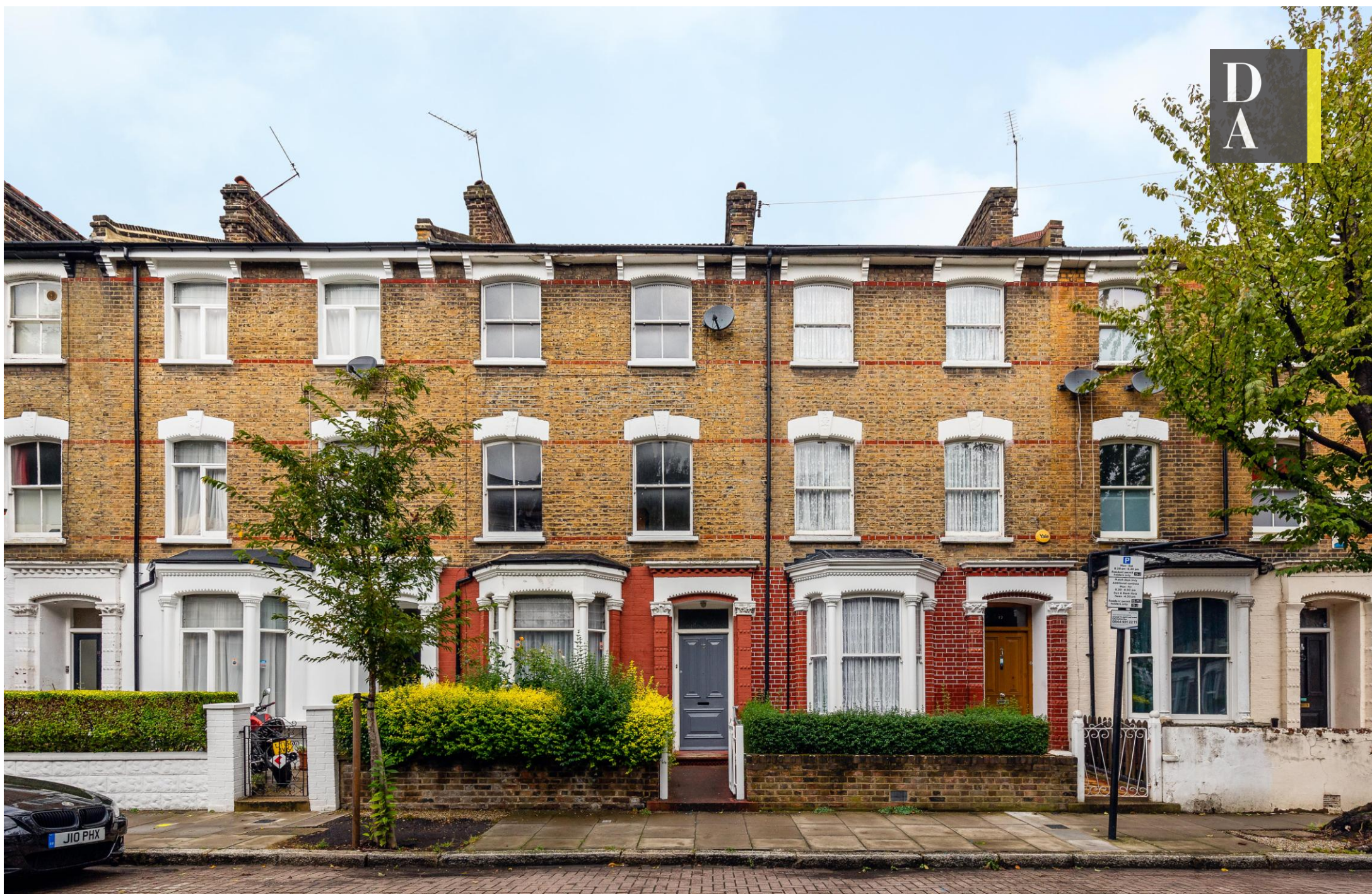
Stonenest Street, N4 3BA