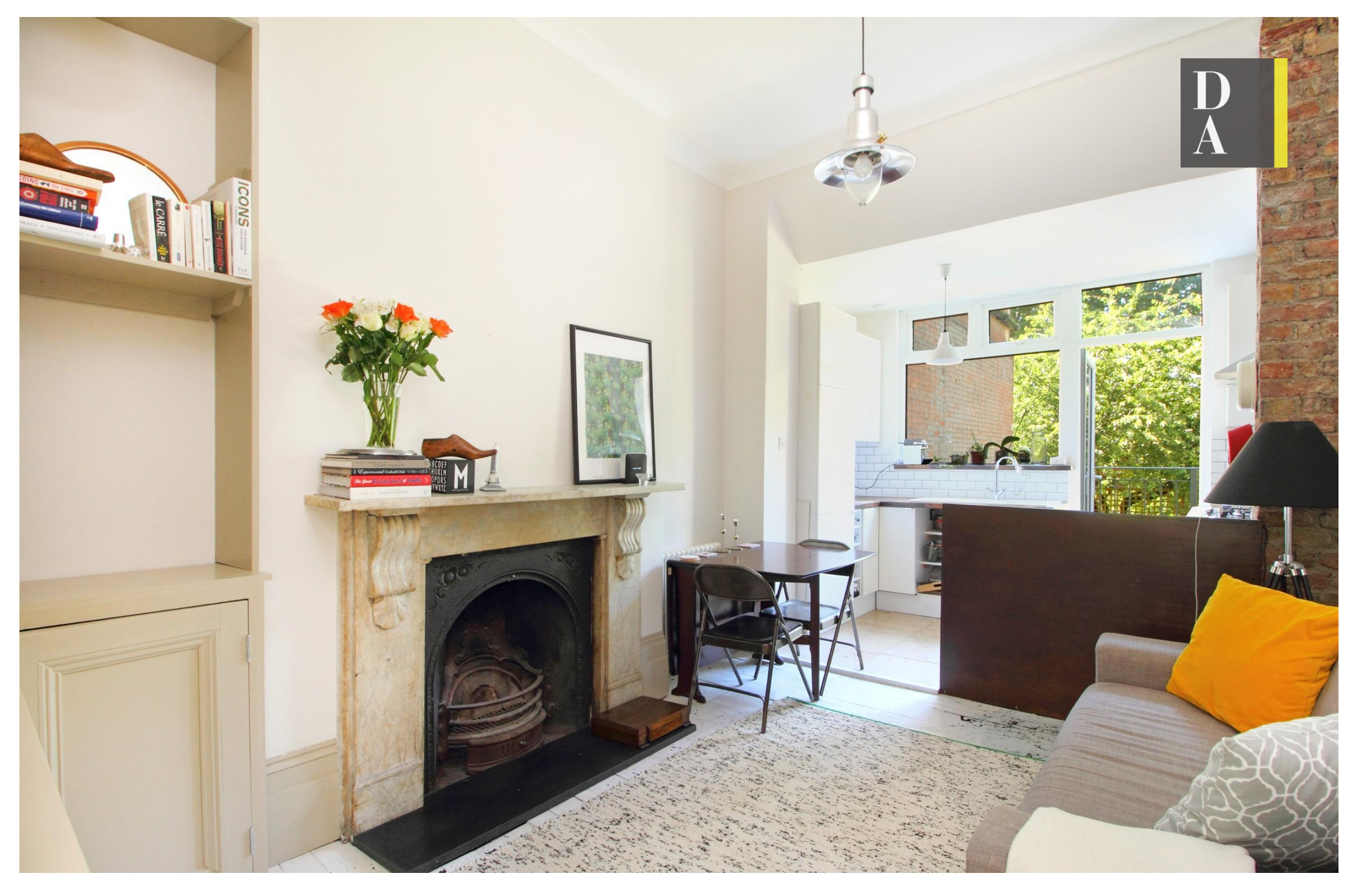
Hanley Road, N4 3DQ