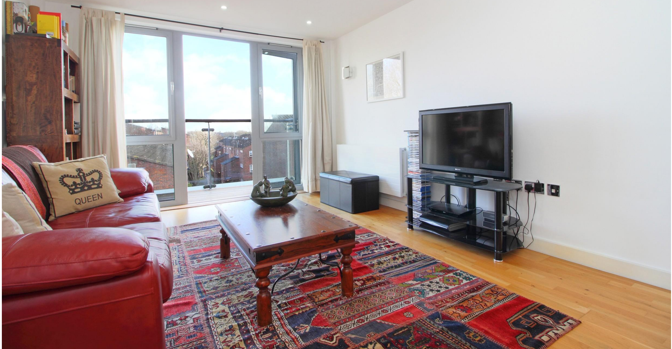
Kinver House, Elthorne Road, N19 4AS