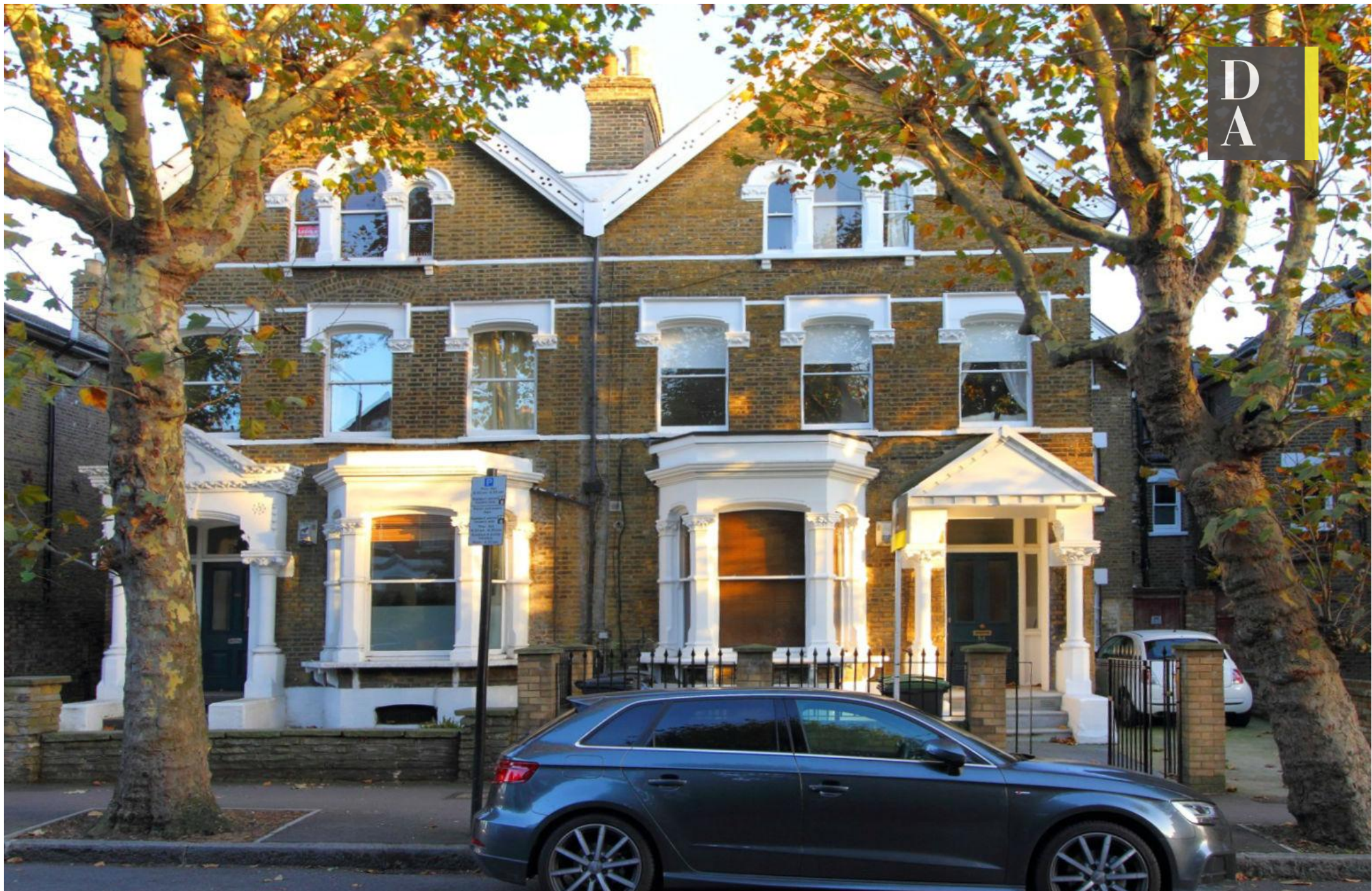
Upper Tollington Park, N4 4NB