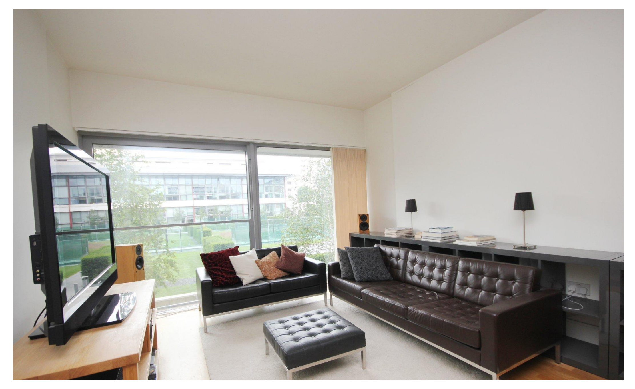
Highbury Stadium Square, N5 1FF