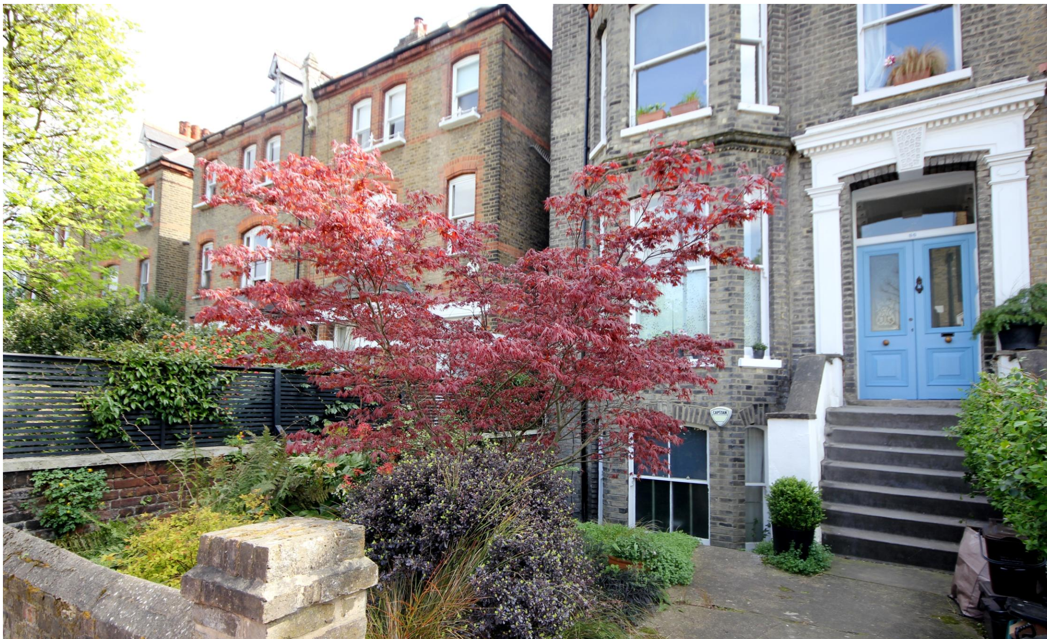
Tollington Park, N4 3RA