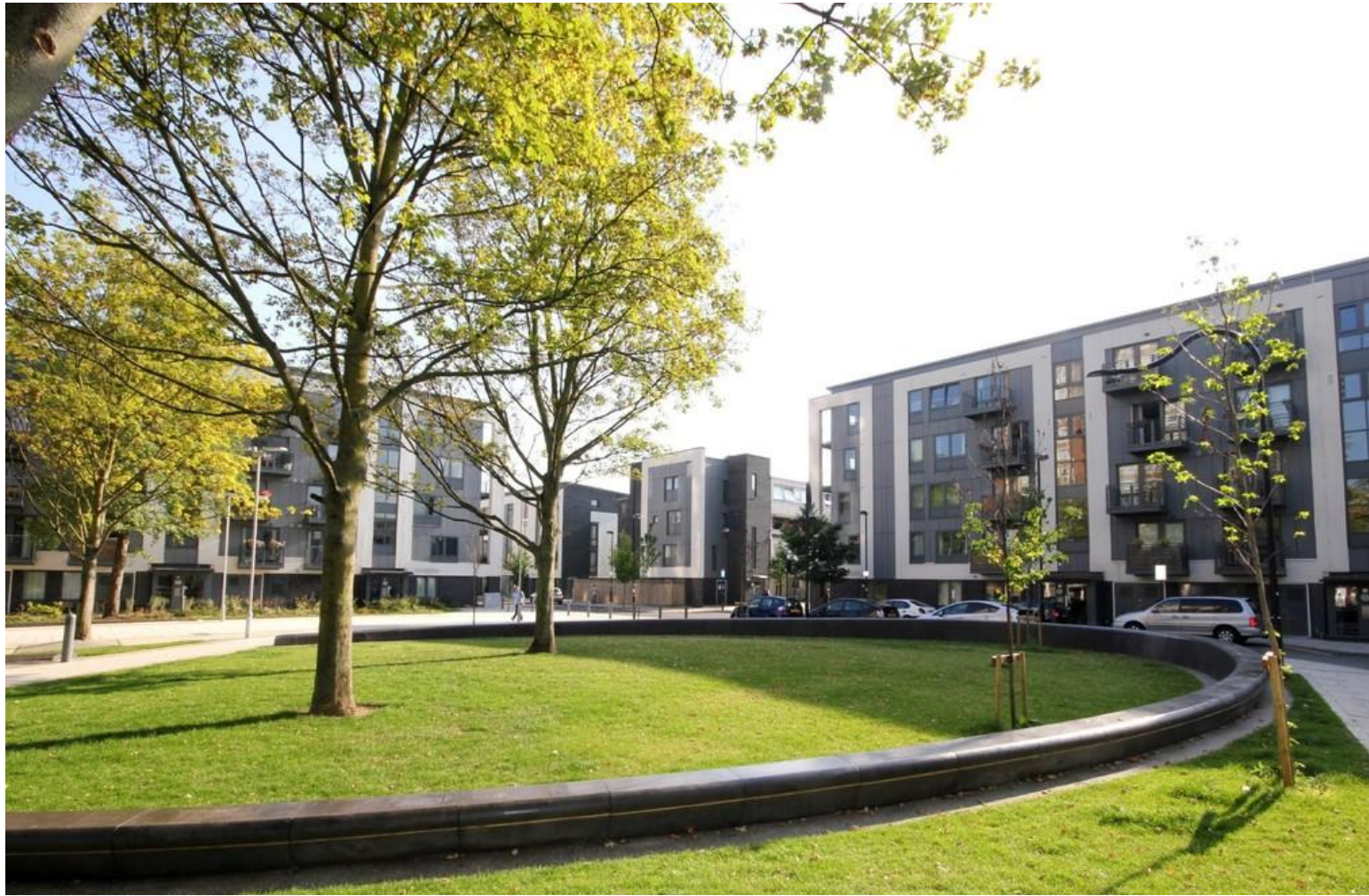
Poolers Park, London N4 3FG