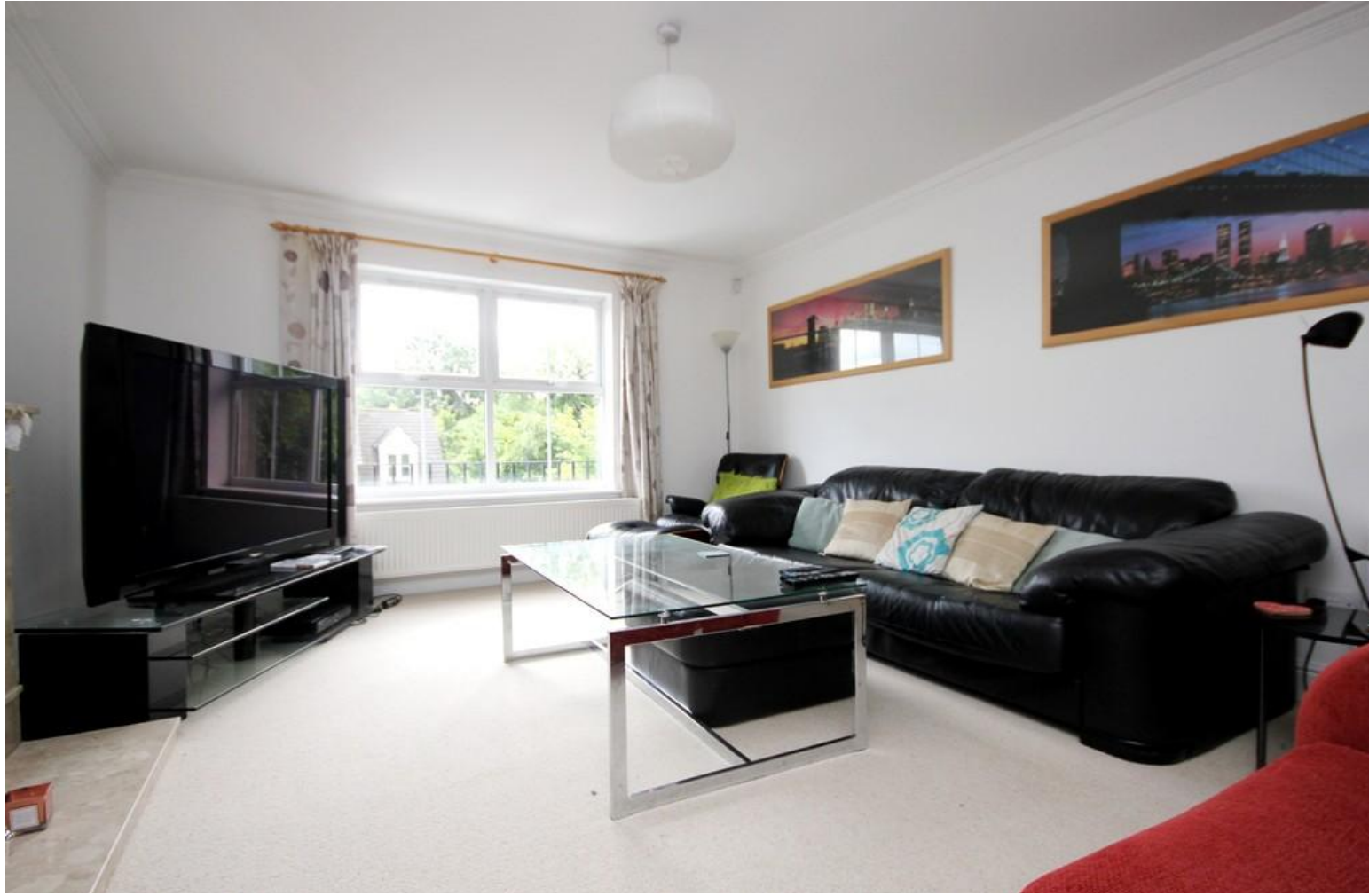
Halton Close N11 3HQ