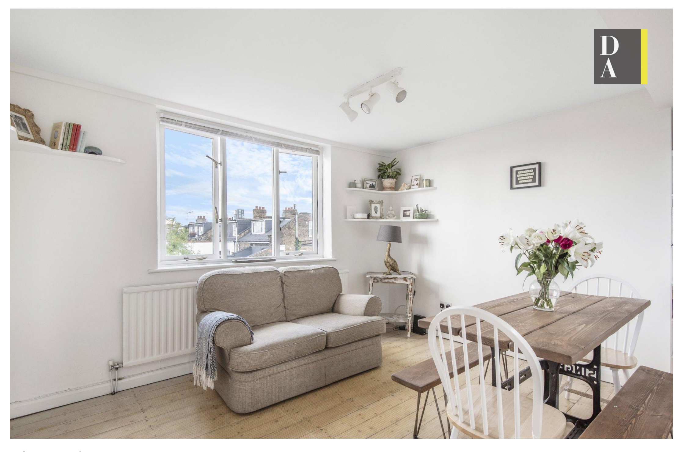
Alexandra Grove, N4 2LF