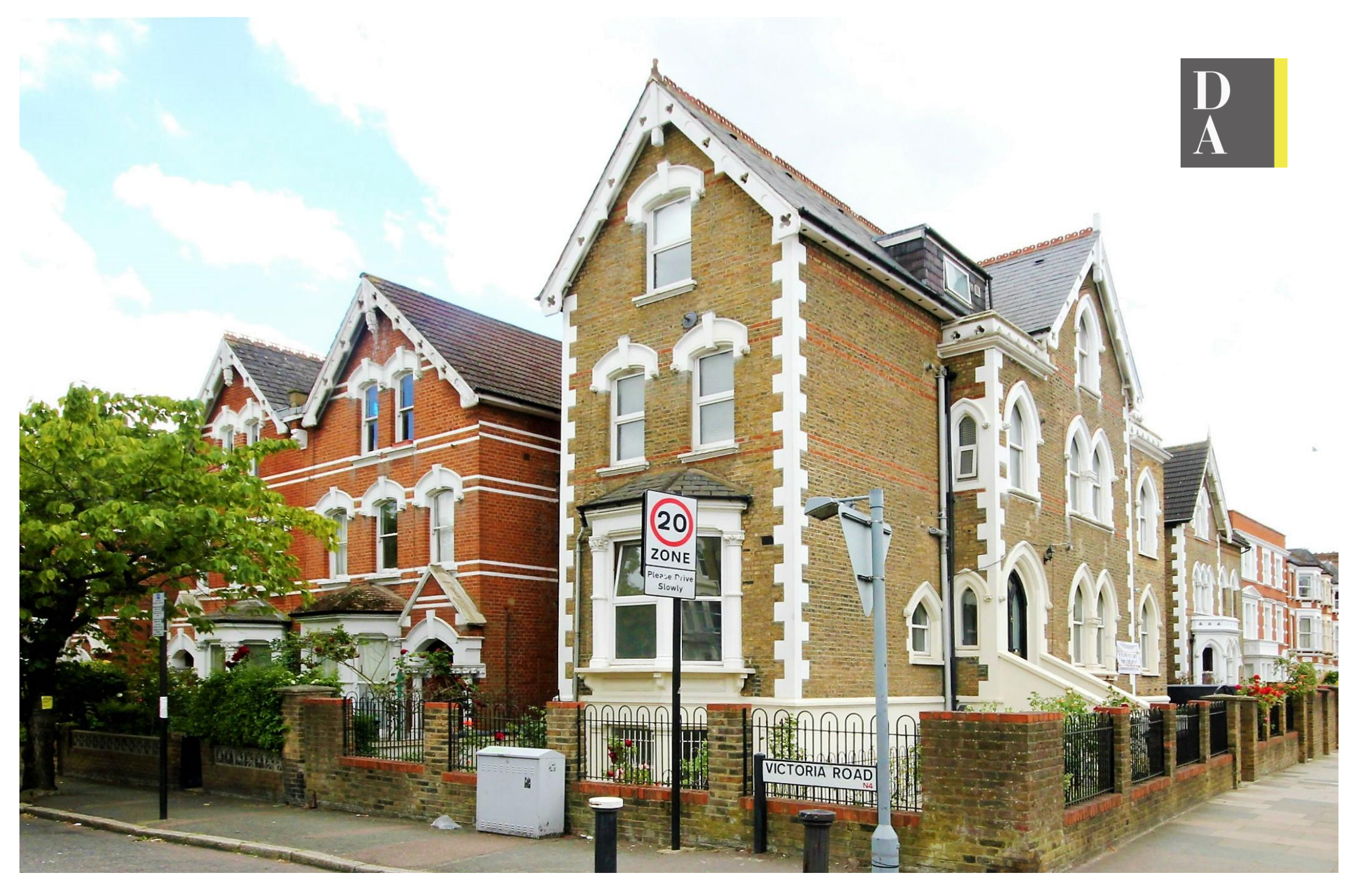
Stapleton Hall Road, N4 3QD