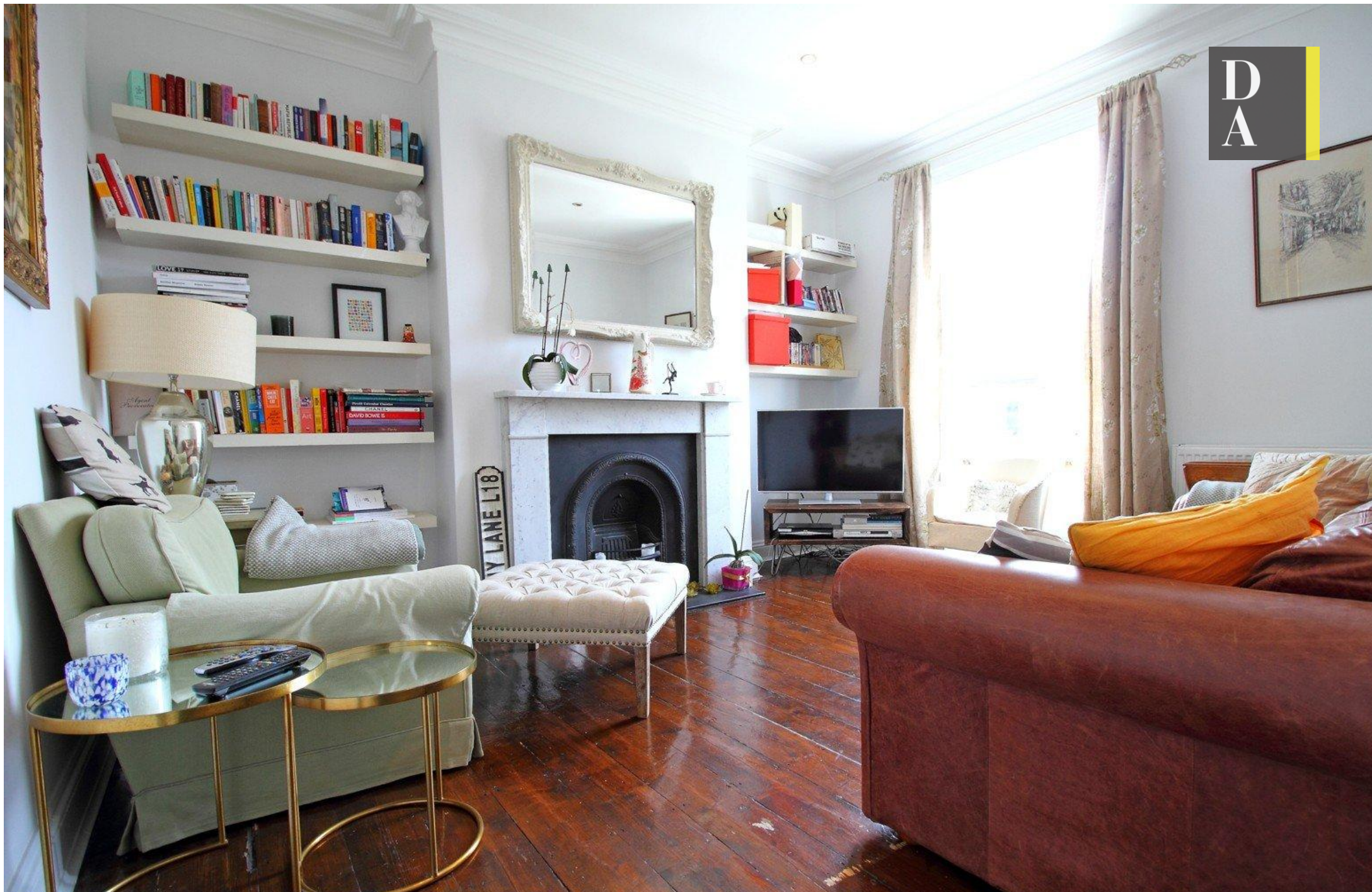
Wilberforce Road, N4 2SP