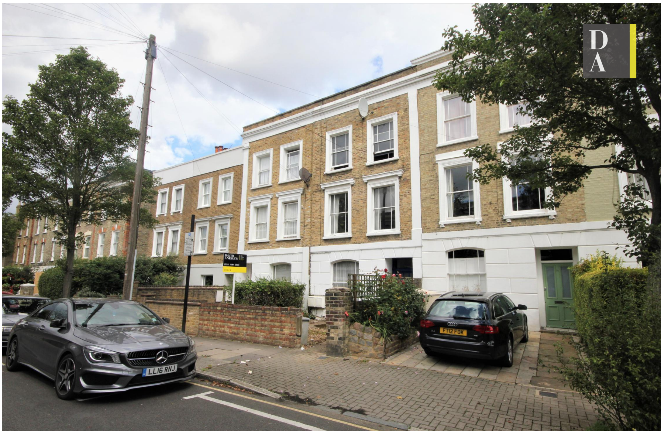
Regina Road, N4 3PP