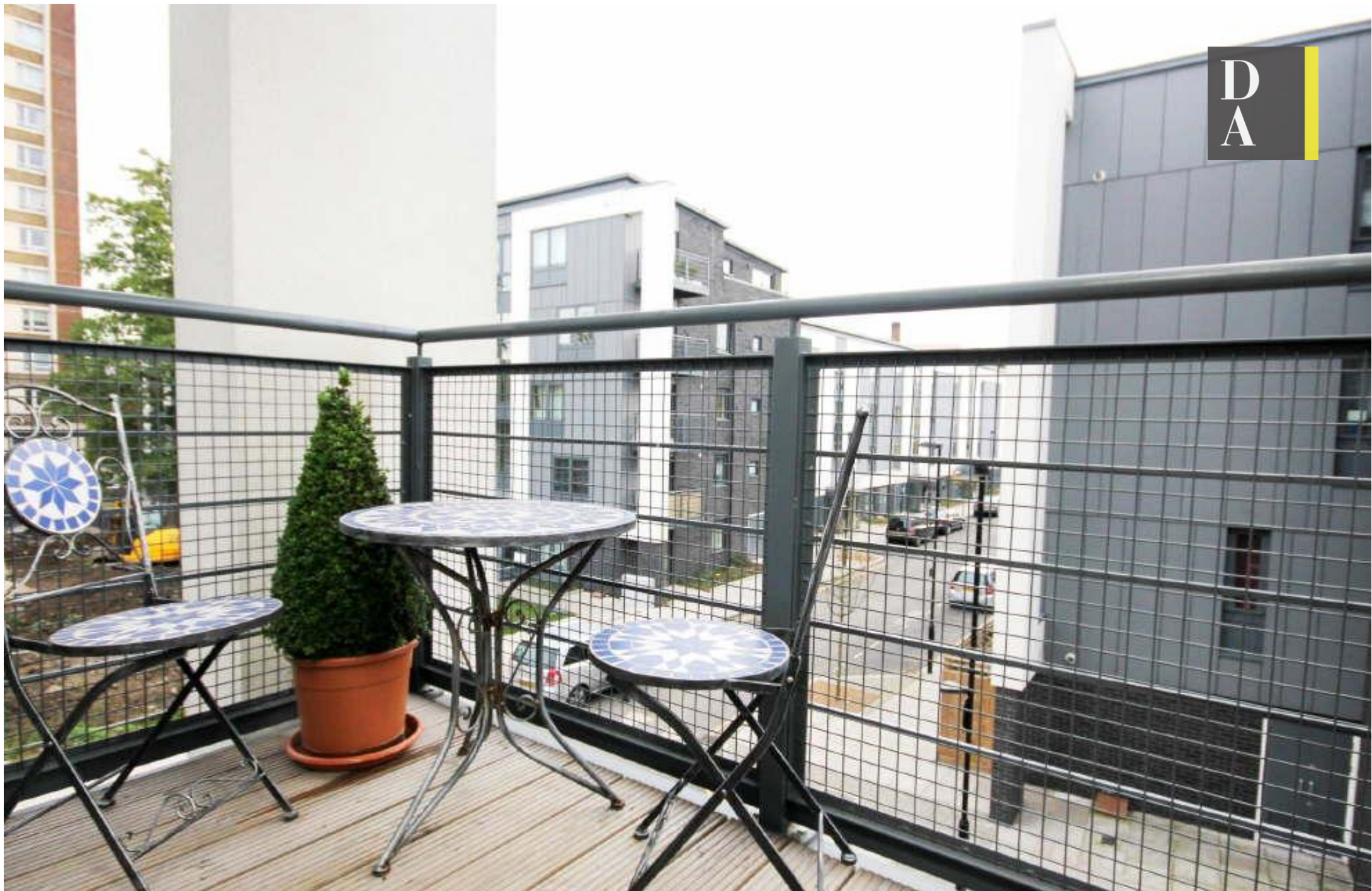
Hollyfield Apartments, N4 3FG